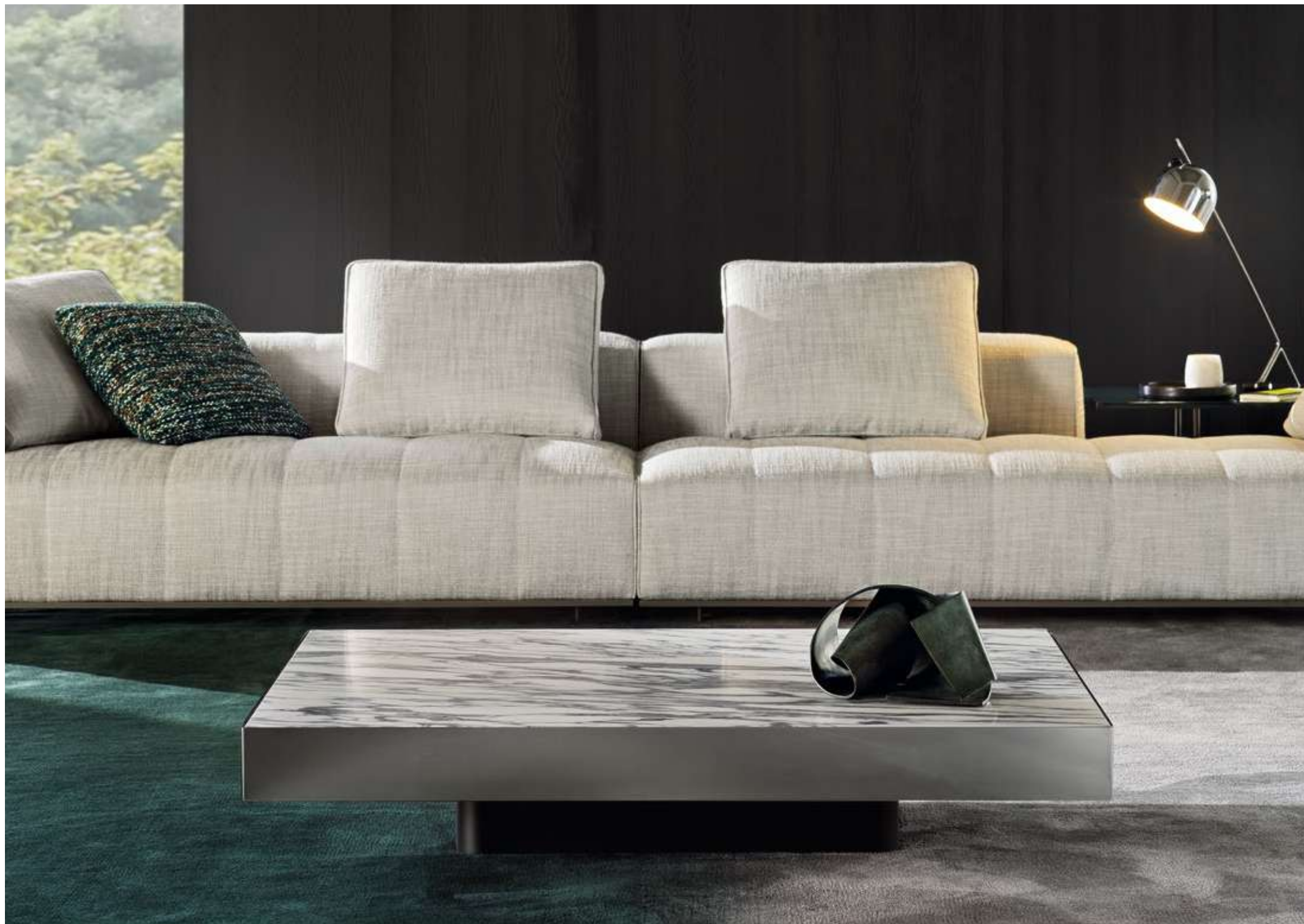
SOLID STEEL COFFEE TABLE CM 130X130 H25 TOP: ARABESCATO GRIGIO MARBLE EDGES: POLISHED STAINLESS STEEL BASE: MATT BLACK COLOUR LACQUER