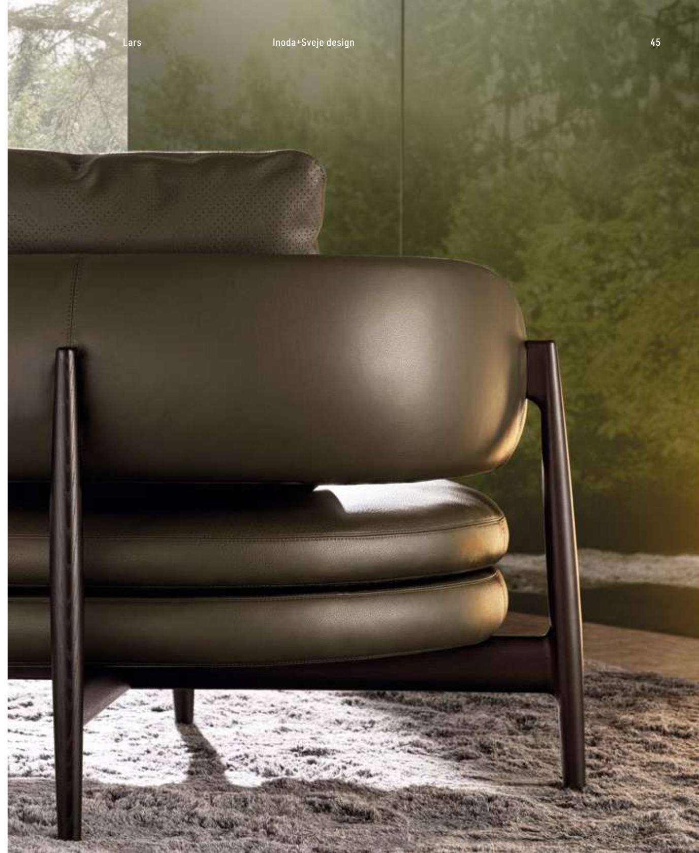
LARS SEMI-ROUND SOFA CM 217X100 H74 LEATHER: ASPEN 34 MUSCHIO (ART 32 - ASPEN LEATHER) STRUCTURE: ASH LICORICE COLOUR LACQUER