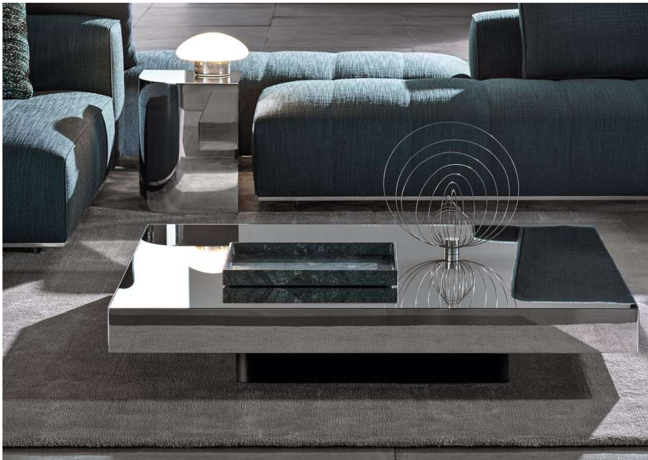
SOLID STEEL COFFEE TABLE CM 130X130 H25 TOP: MIRROR EDGES: POLISHED STAINLESS STEEL BASE: MATT BLACK COLOUR LACQUER