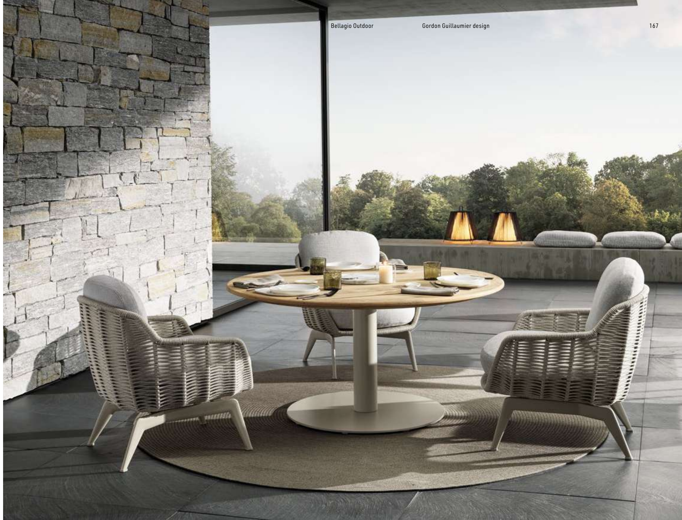
BELLAGIO OUTDOOR LOUNGE/DINING TABLE Ø CM 140 H67 TOP: NATURAL TEAK BASE: VARNISHED MATT ECRU COLOUR STEEL