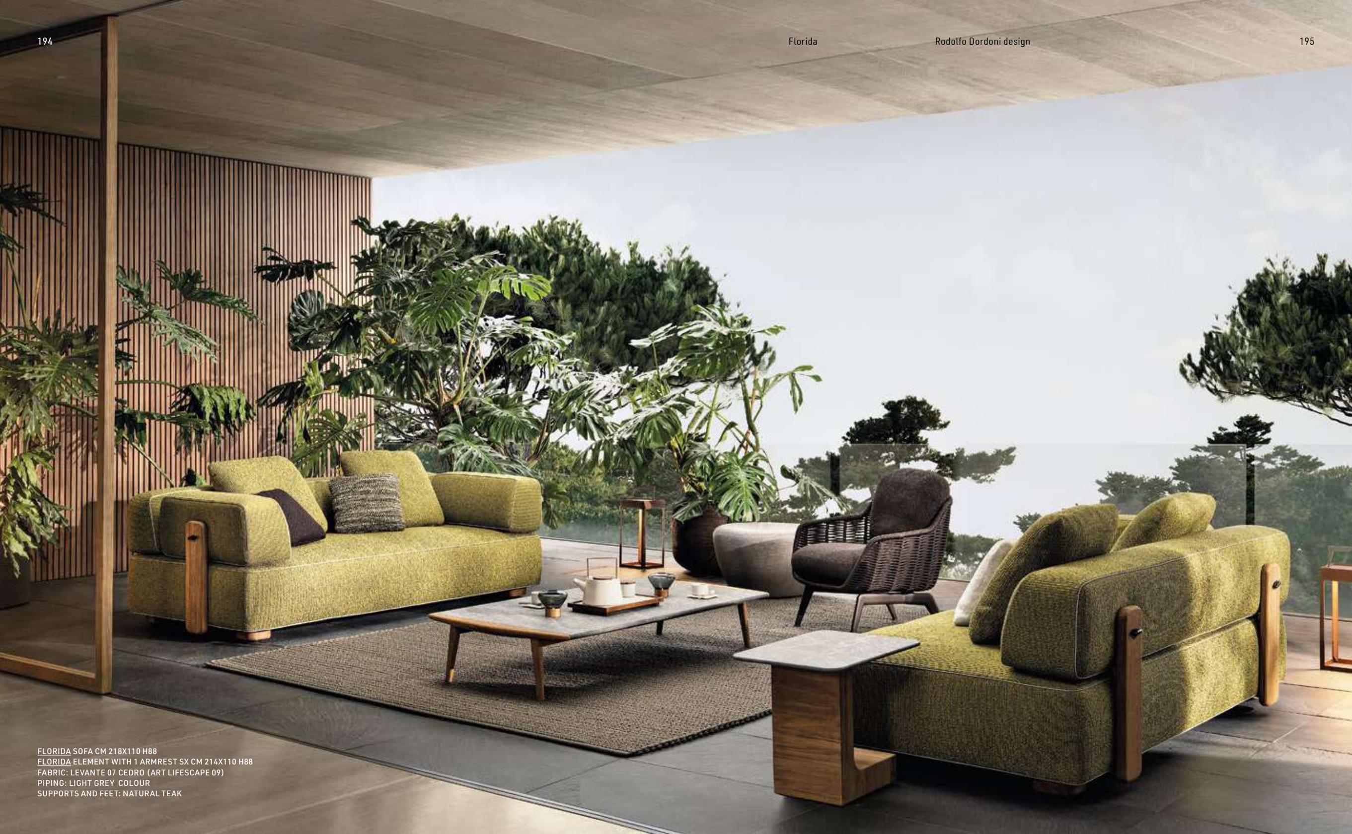
FLORIDA SOFA CM 218X110 H88 FLORIDA ELEMENT WITH 1 ARMREST SX CM 214X110 H88 FABRIC: LEVANTE 07 CEDRO (ART LIFESCAPE 09) PIPING: LIGHT GREY COLOUR SUPPORTS AND FEET: NATURAL TEAK