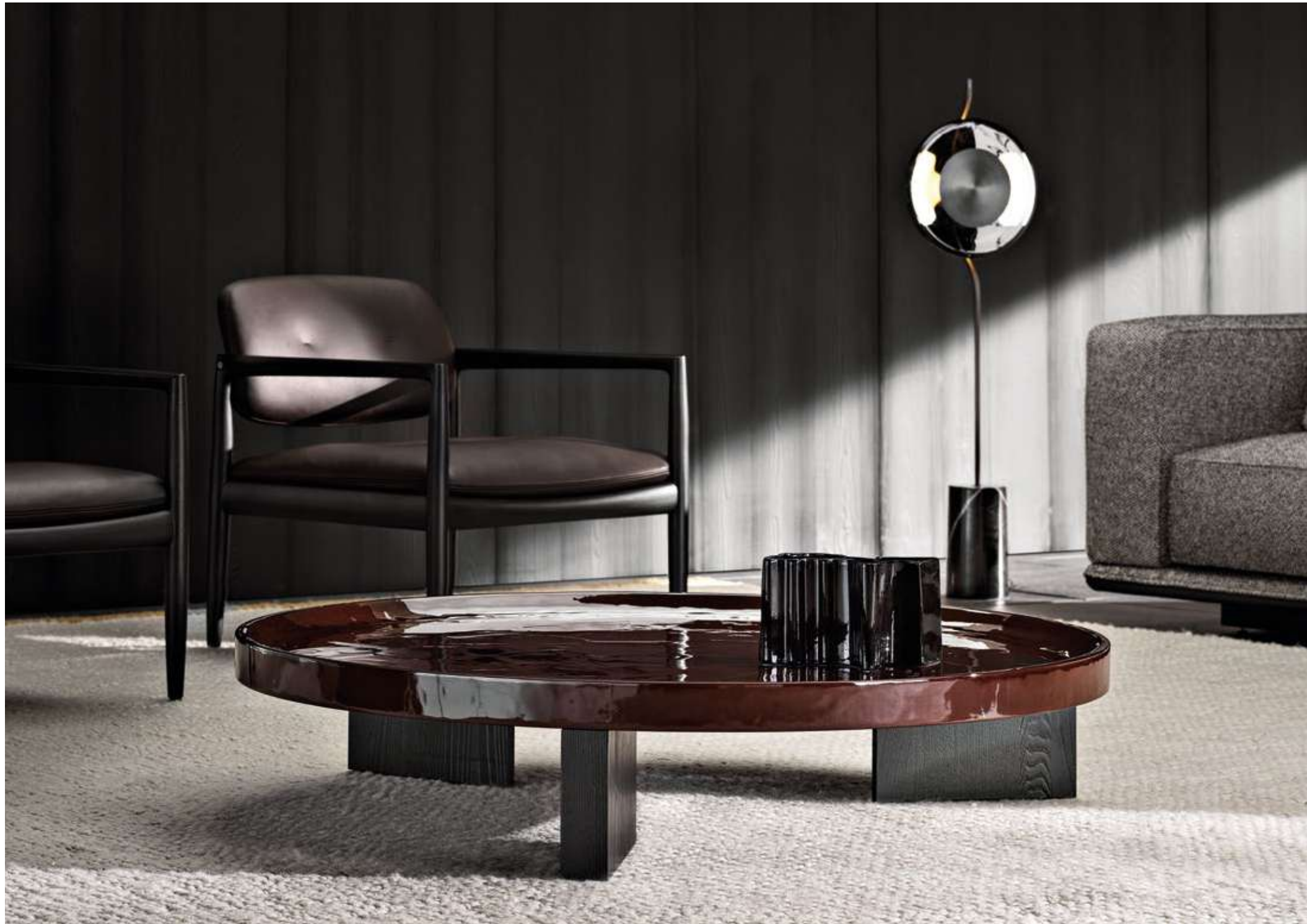
LOUVER COFFEE TABLE Ø CM 120 H25 TOP: GLOSSY CHESTNUT COLOUR LACQUER LEGS: ASH LICORICE COLOUR LACQUER