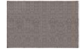
OSAKA CHEVRON MINOTTI STUDIO DESIGN 10-48-50-106-140-156