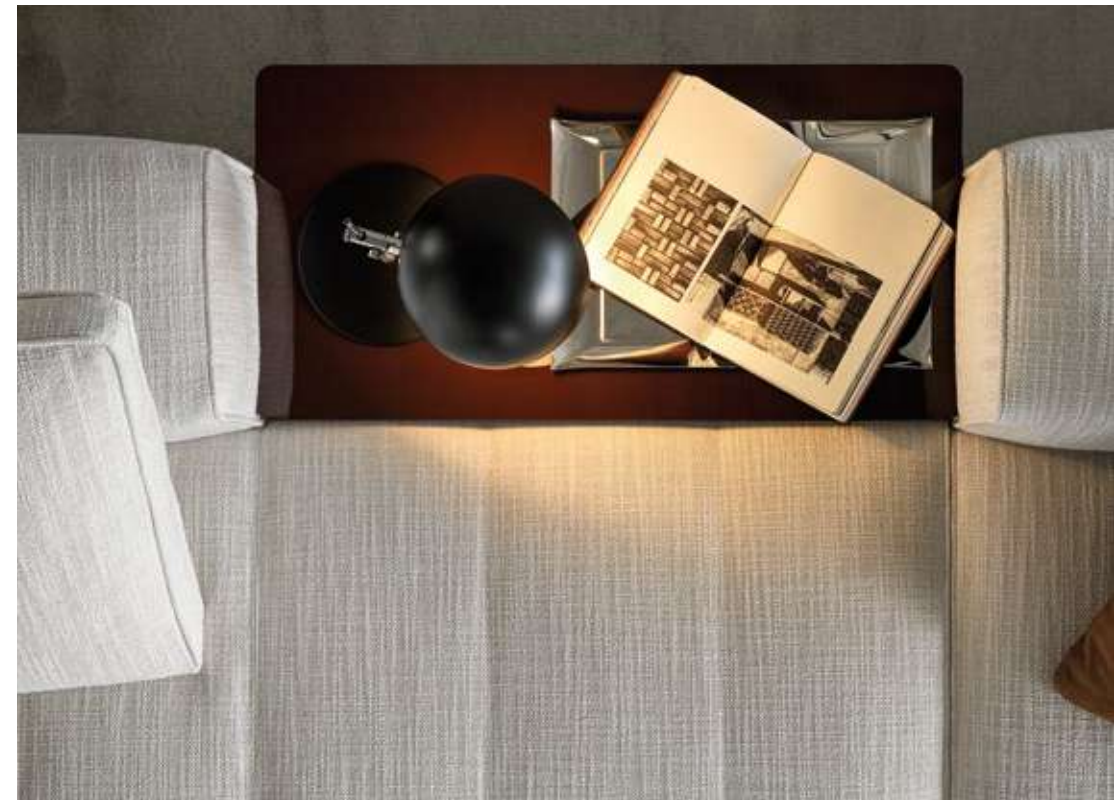
LELONG SIDE TABLE CM 74X40 H35 TOP: GLOSSY CHESTNUT COLOUR LACQUER BASE: VARNISHED POLISHED BLACK COFFEE COLOUR METAL