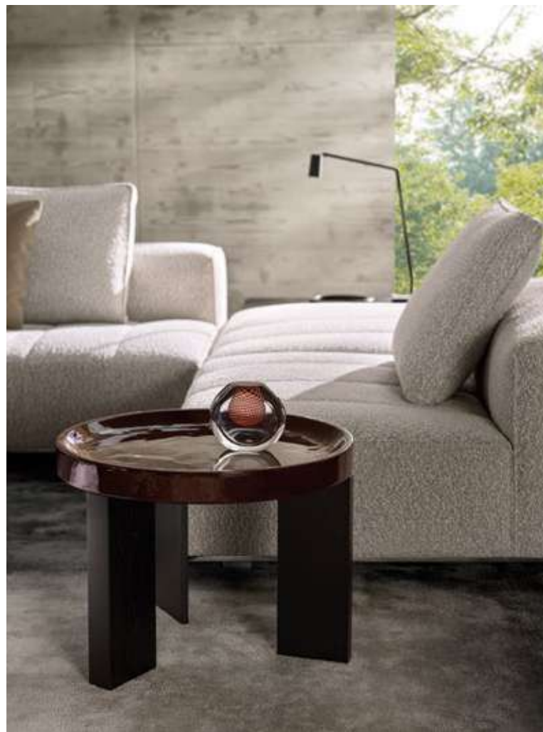
LOUVER SIDE TABLE Ø CM 60 H45 TOP: GLOSSY CHESTNUT COLOUR LACQUER LEGS: ASH LICORICE COLOUR LACQUER