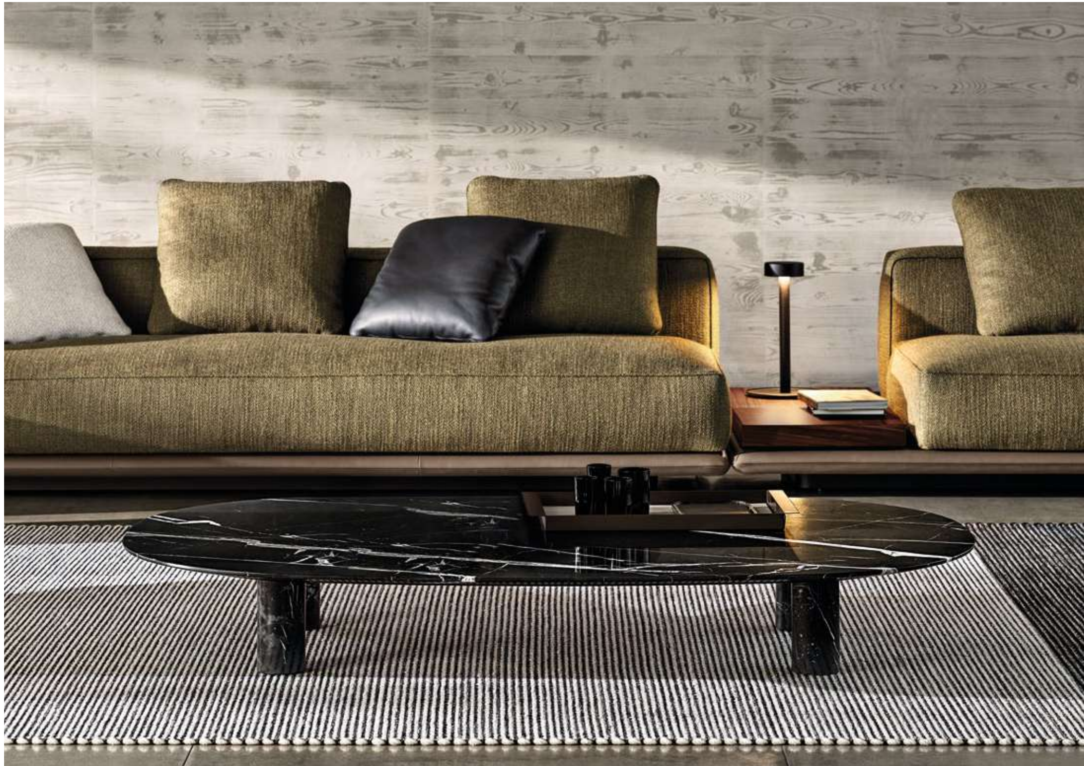
GLADSTONE COFFEE TABLE CM 180X105 H25 TOP AND LEGS: NERO MARQUINA MARBLE