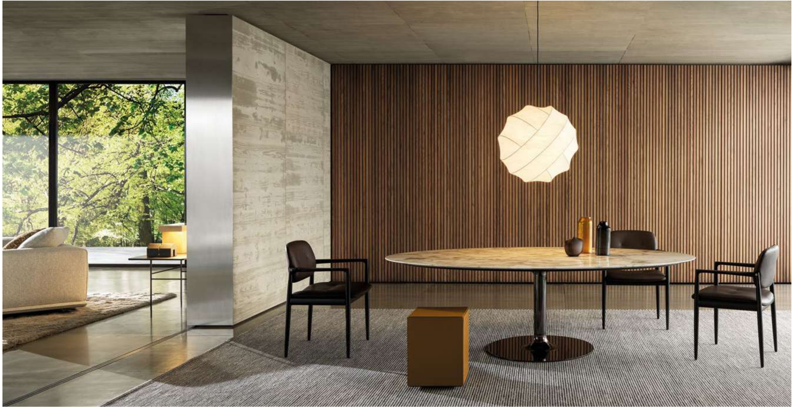
OLIVER DINING TABLE CM 240X140 H73 TOP: CALACATTA MARBLE BASE: VARNISHED POLISHED BLACK-NICKEL METAL