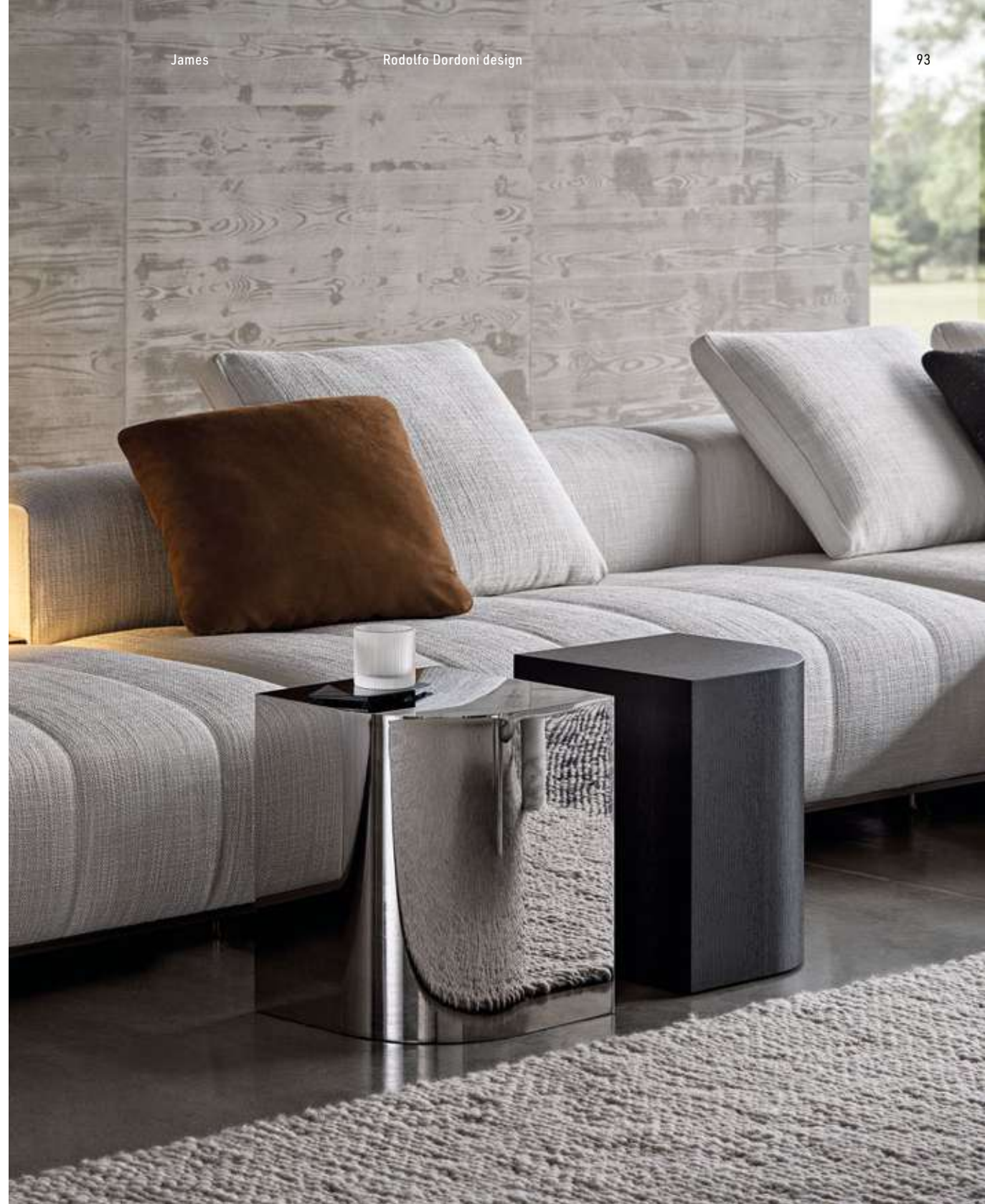
JAMES SIDE TABLE CM 35X35 H45 STRUCTURE: POLISHED STAINLESS STEEL