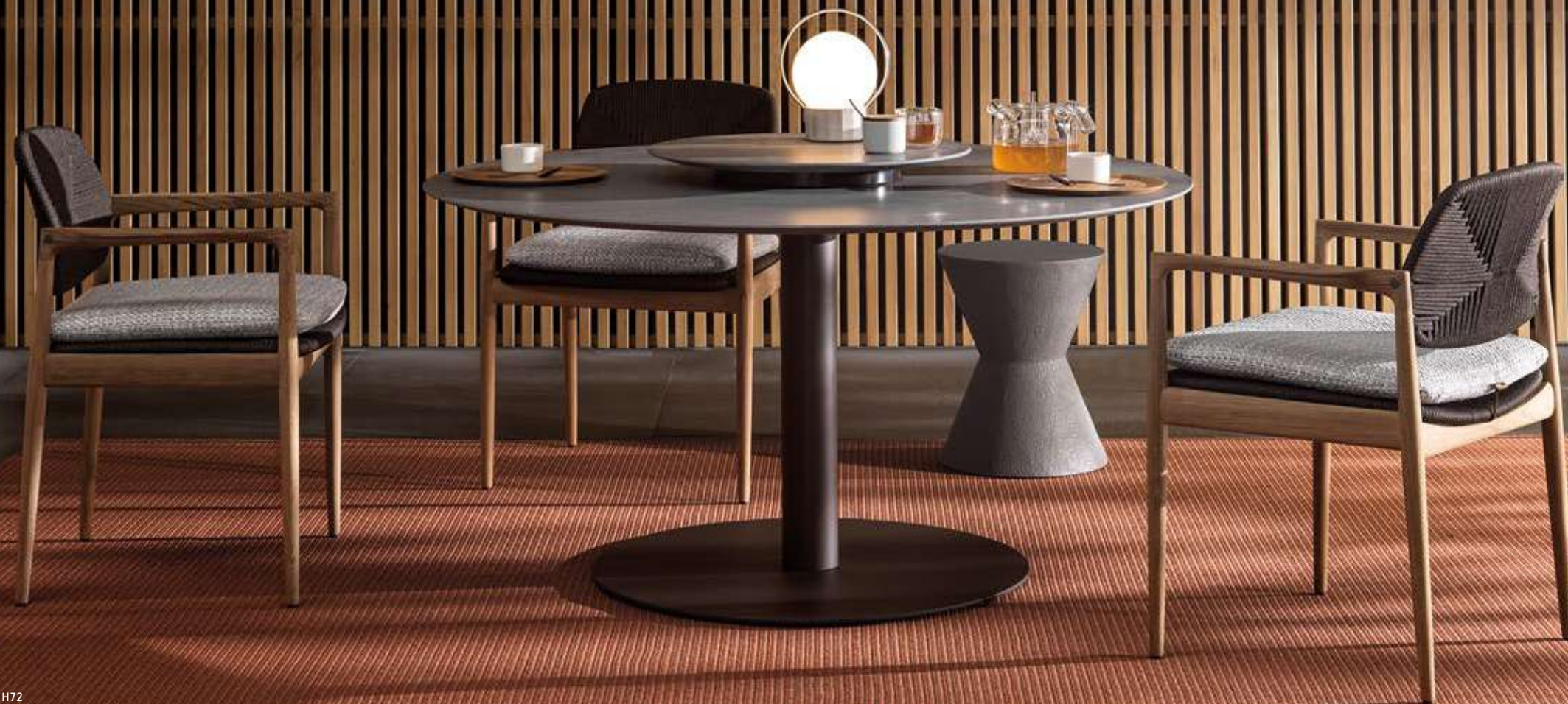
BELLAGIO OUTDOOR DINING TABLE Ø CM 140 H72 BELLAGIO OUTDOOR LAZY SUSAN Ø CM 60 H5,5 TOP: BASALTINA STONE BASE: VARNISHED MATT DARK BROWN COLOUR STEEL