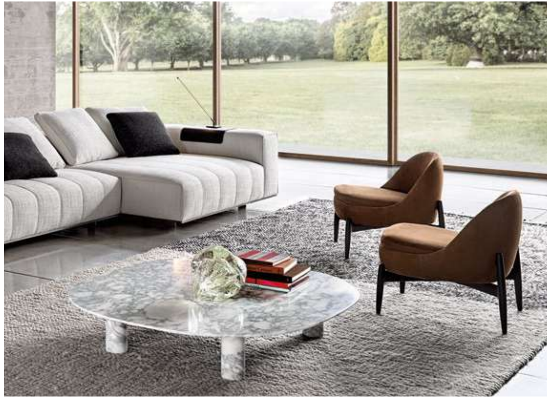
SENDAI LOUNGE ARMCHAIRS CM 65X67 H67 LEATHER: NABUK 22 COGNAC (ART 32 - NABUK LEATHER) STRUCTURE: ASH LICORICE COLOUR LACQUER