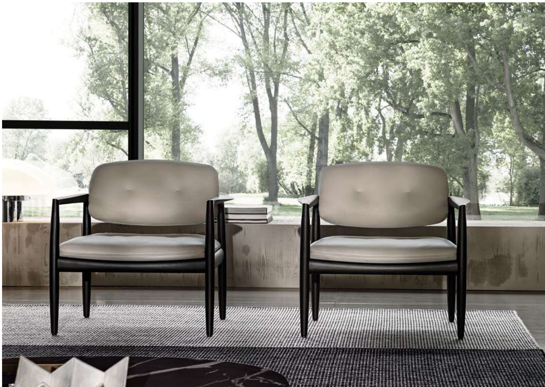
YOKO ARMCHAIRS CM 77X75 H73 LEATHER: ASPEN 06 POMICE (ASPEN LEATHER) STRUCTURE: ASH LICORICE COLOUR LACQUER