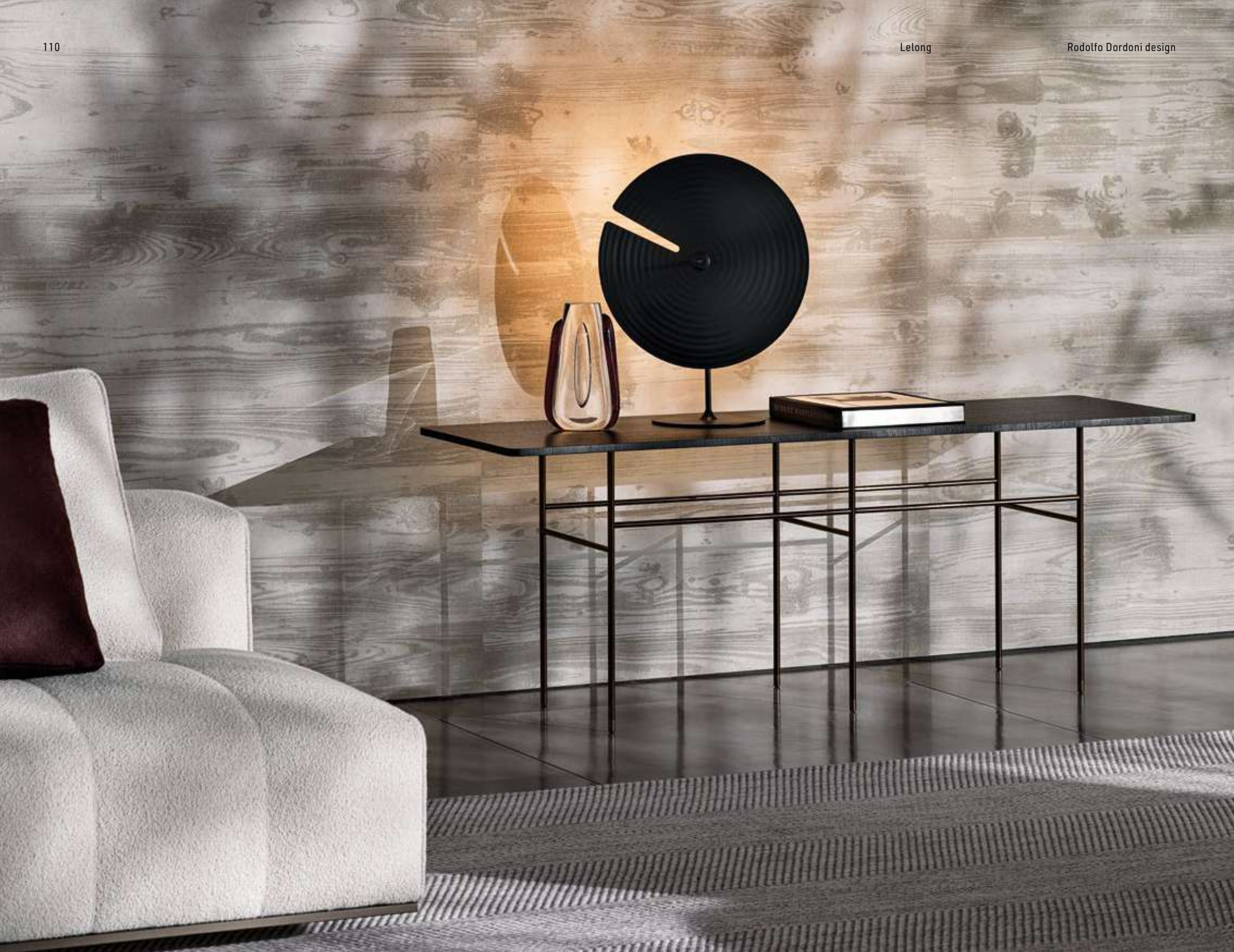
LELONG CONSOLE TABLE CM 160X50 H59 TOP: ASH LICORICE COLOUR LACQUER BASE: VARNISHED POLISHED BLACK COFFEE COLOUR METAL