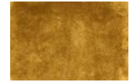
DIBBETS (UPDATE) RODOLFO DORDONI DESIGN 136