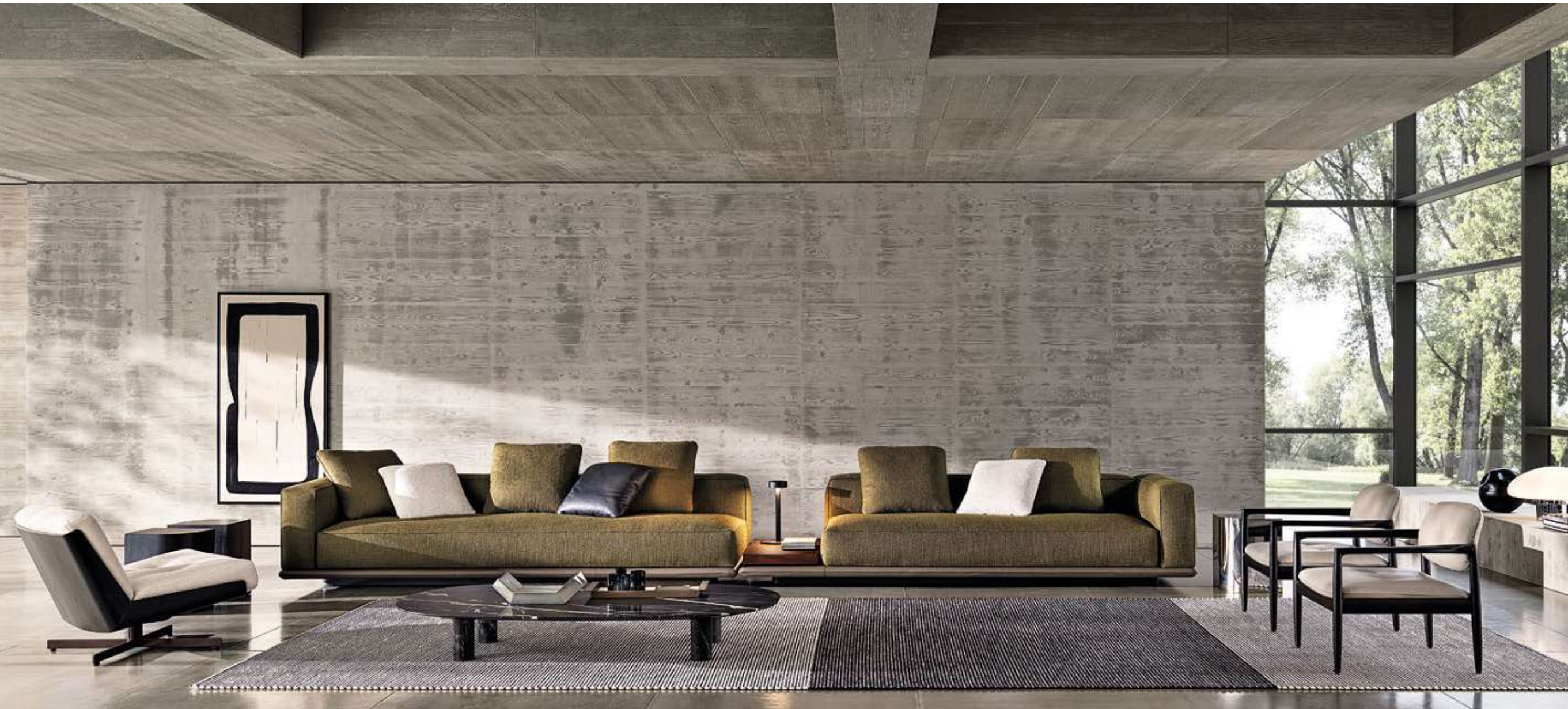
HORIZONTE ELEMENT WITH 1 ARMREST SX CM 284X106 H85 HORIZONTE ELEMENT WITH 1 ARMREST DX WITH TOP SHORT CM 284X106 H85 FABRIC: NATTE 07 KAKI (ART 35) LEATHER: ASPEN 29 PELTRO (ASPEN LEATHER) TABLE-TOP SURFACE: DARK BROWN STAINED CANALETTO WALNUT BASE: VARNISHED MATT BLACK COLOUR METAL