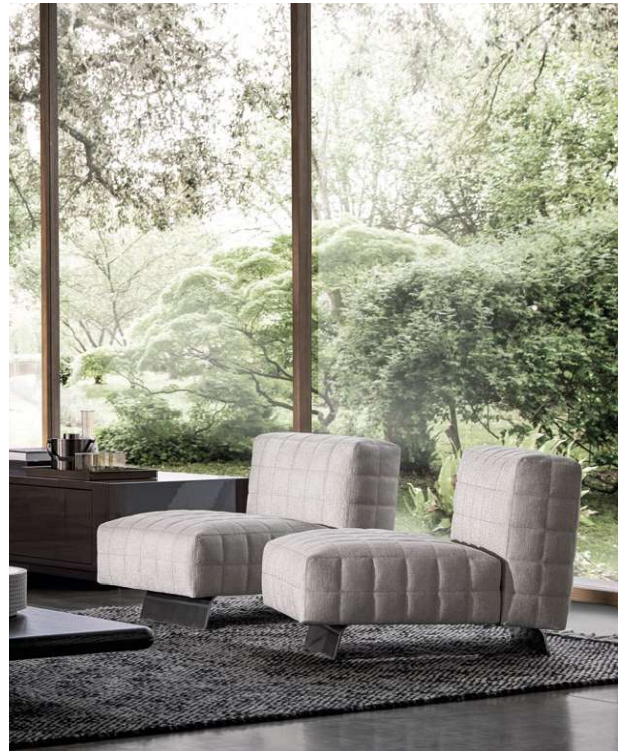
TWIGGY SMALL ARMCHAIRS CM 64X90 H66 FABRIC: STANDARD 10 GESSO (ART 30) BASES: BRUSHED SEMI-POLISHED ALUMINIUM