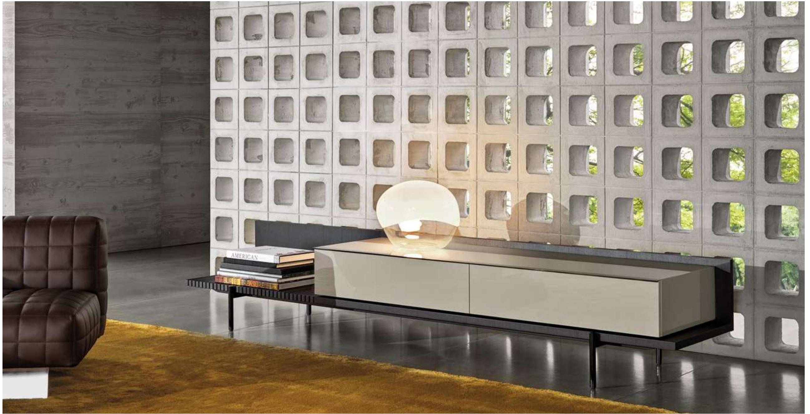
SUPERQUADRA LIVING/TV SIDEBOARD CM 273,5X60 H48,5 STRUCTURE AND SLATS: ASH BLACK COLOUR LACQUER STORAGE ELEMENT: GLOSSY CAPPUCCINO COLOUR LACQUER BASE: VARNISHED POLISHED BRANDY COLOUR ALUMINIUM