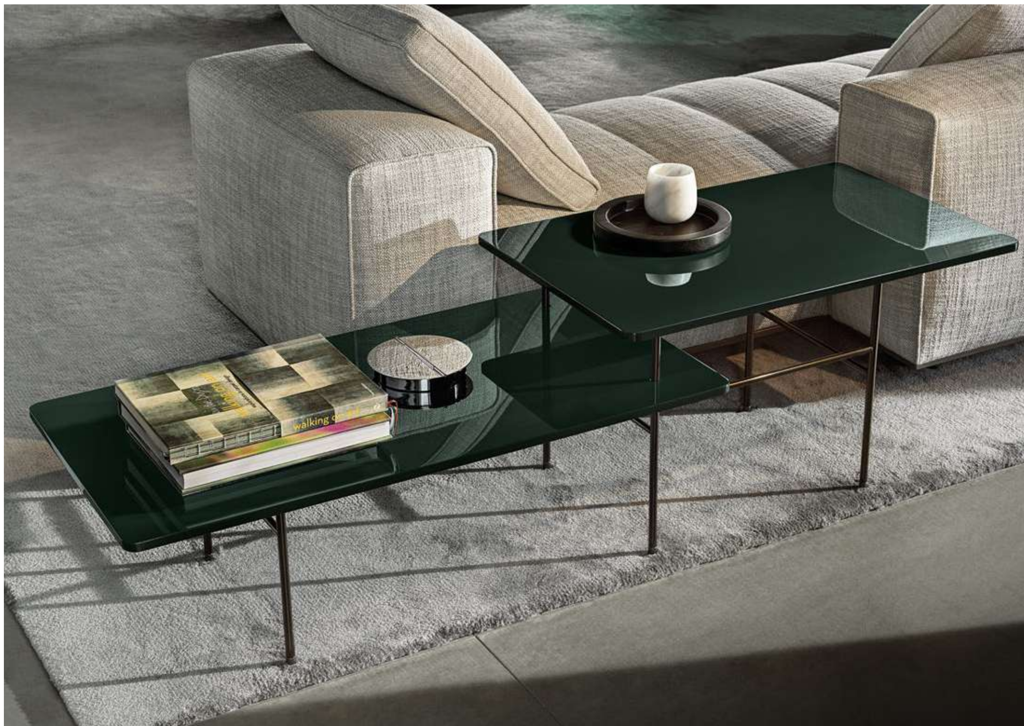
Lelong COFFEE TABLE WITH 2 TOPS CM 160X50 H48 LOWER TOP: GLOSSY MALACHITE COLOUR LACQUER UPPER TOP: GLOSSY MALACHITE COLOUR LACQUER BASE: VARNISHED POLISHED BLACK COFFEE COLOUR METAL