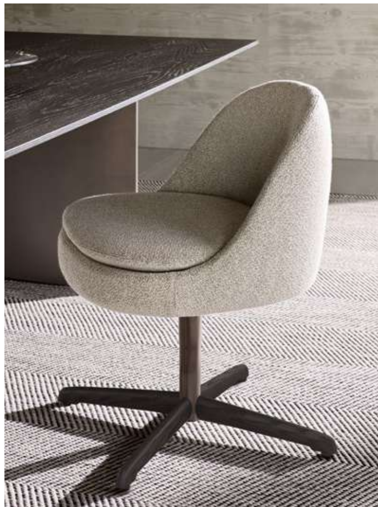
SENDAI SWIVEL DINING LITTLE ARMCHAIR CM 58X60 H77 FABRIC: TIBET 02 GHIACCIO (ART 37) BASE: VARNISHED POLISHED BRONZE COLOUR METAL SPOKES: ASH LICORICE COLOUR LACQUER