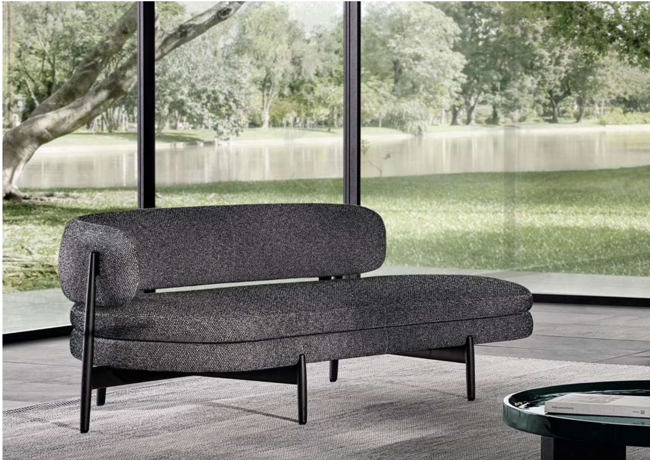
LARS SEMI-ROUND SOFA CM 217X100 H74 FABRIC: TIBET 04 CENERE (ART 37) STRUCTURE: ASH LICORICE COLOUR LACQUER