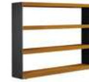
CARSON BOOKCASE (UPDATE) RODOLFO DORDONI DESIGN 254