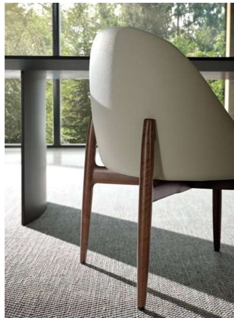
SENDAI DINING LITTLE ARMCHAIR CM 58X60 H77 LEATHER: ASPEN 38 NUVOLA (ART 36/37 - ASPEN LEATHER) STRUCTURE: LIGHT BROWN STAINED CANALETTO WALNUT