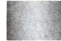
WISP SHADE MINOTTI STUDIO DESIGN 16-94