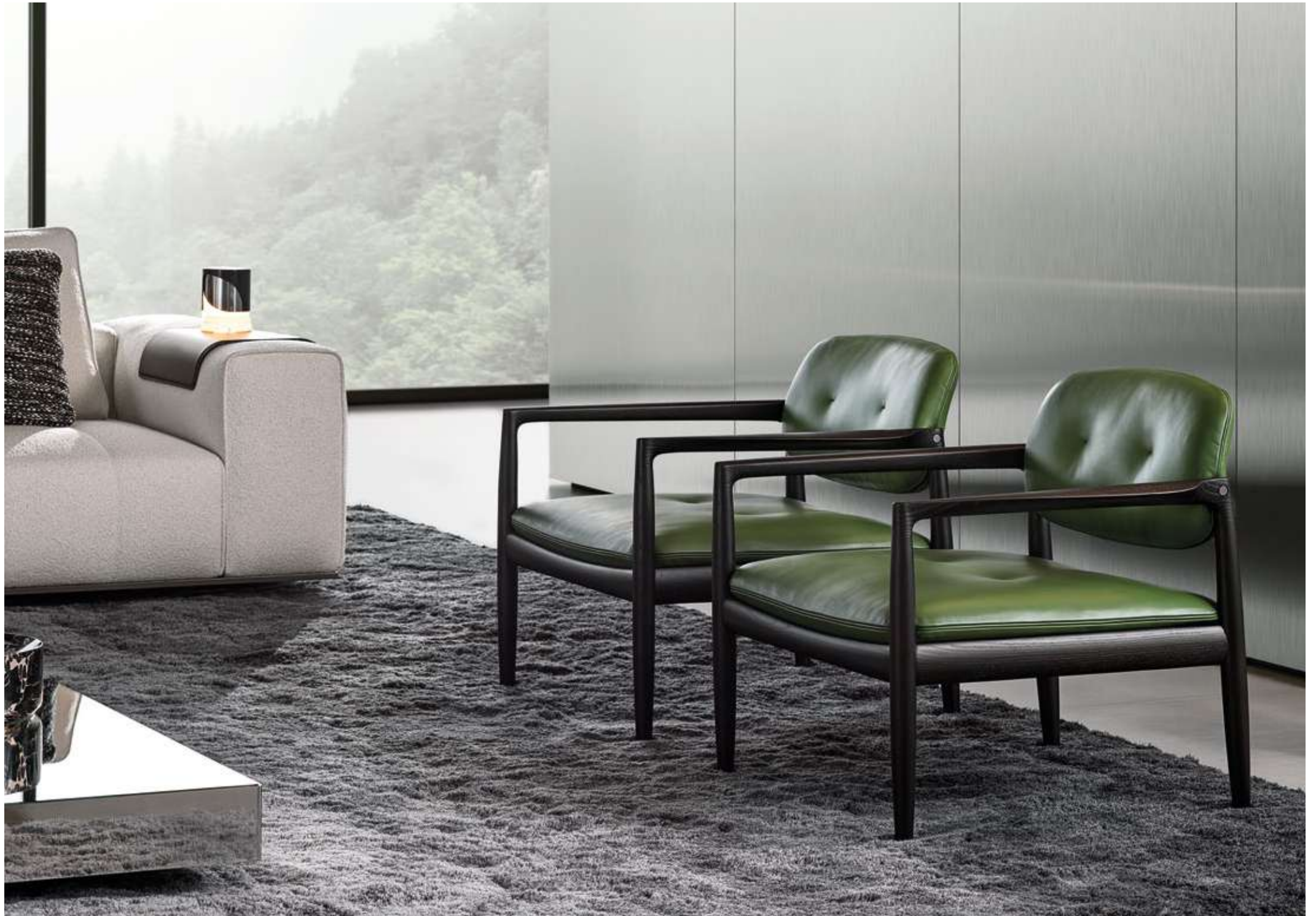
YOKO ARMCHAIRS CM 77X75 H73 LEATHER: ASPEN 39 FELCE (ART 36/37 - ASPEN LEATHER) STRUCTURE: ASH LICORICE COLOUR LACQUER