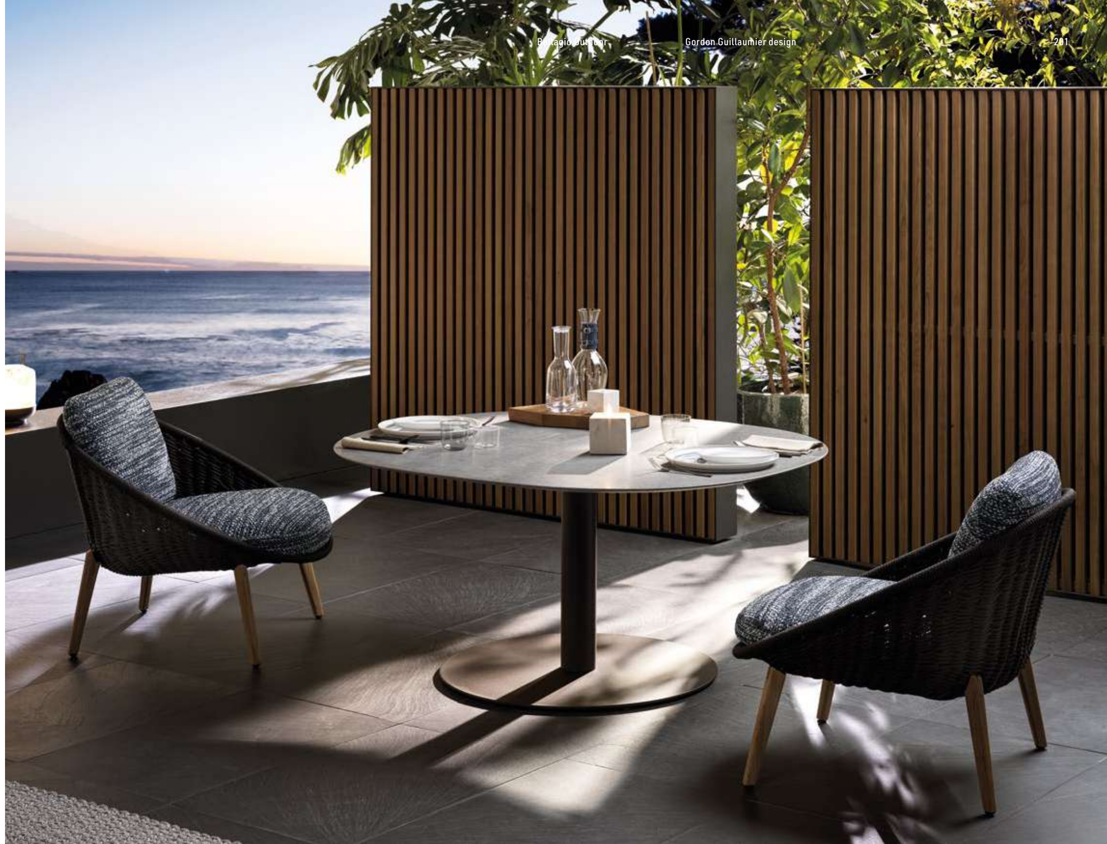
BELLAGIO OUTDOOR LOUNGE/DINING TABLE CM 140X120 H67 TOP: BASALTINA STONE BASE: VARNISHED MATT DARK BROWN COLOUR STEEL