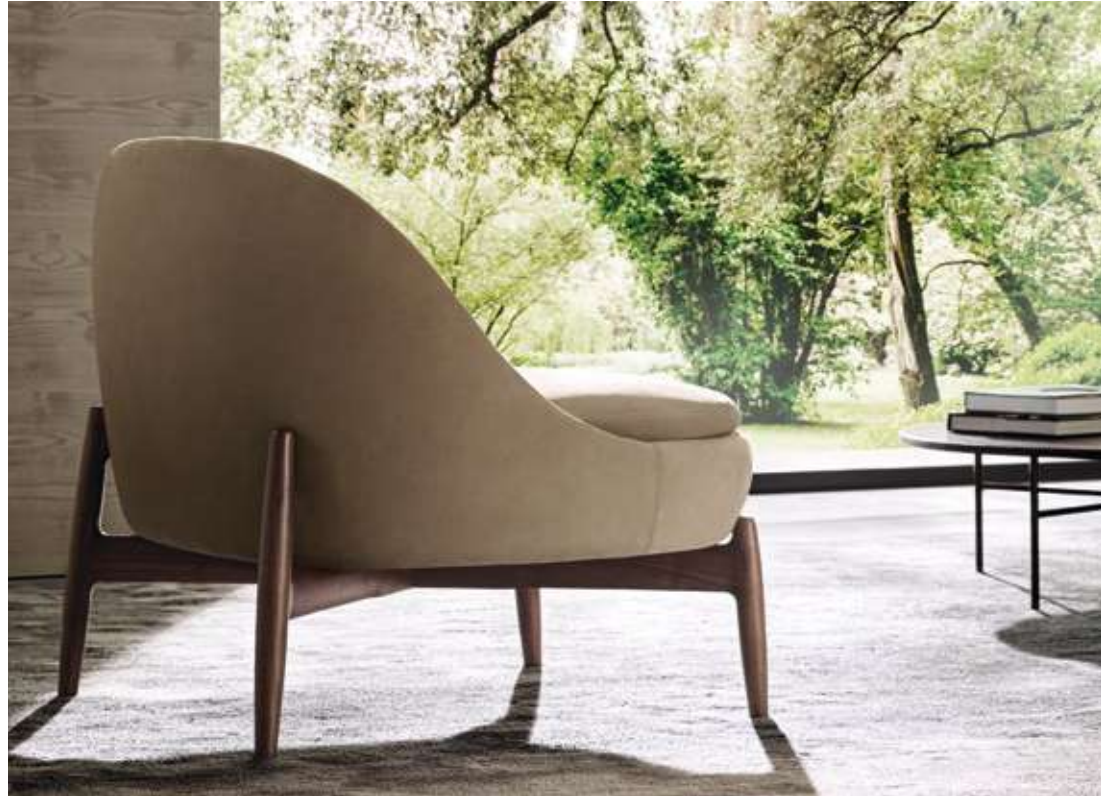
SENDAI ARMCHAIR CM 74X76 H72 LEATHER: NABUK 24 CANAPA (ART 35 - NABUK LEATHER) STRUCTURE: LIGHT BROWN STAINED CANALETTO WALNUT