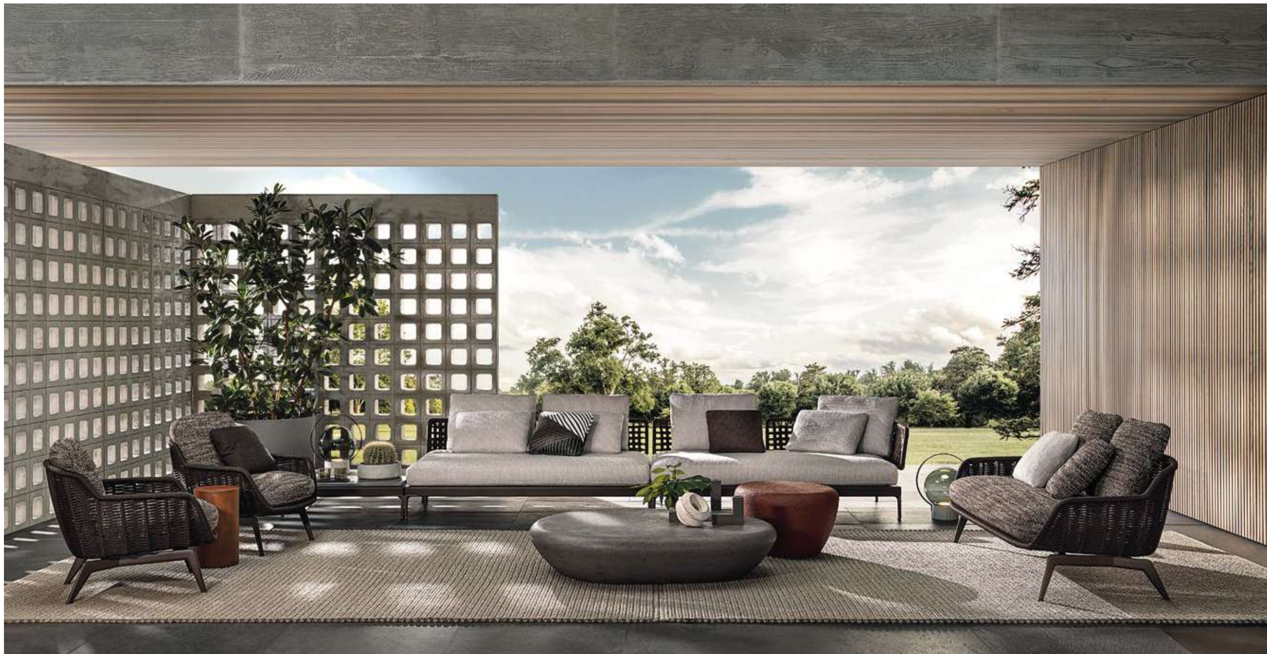
BELT CORD OUTDOOR ARMCHAIRS CM 77X86 H80 BELT CORD OUTDOOR SOFA CM 182X85 H85 FABRIC: BUTTERFLY 03 NOCCIOLA (ART LIFESCAPE 10) FIBER: DARK BROWN COLOUR BASE: VARNISHED MATT DARK BROWN COLOUR ALUMINIUM