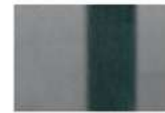
LANDFIELD STRIPES MINOTTI STUDIO DESIGN 112-122-130-148