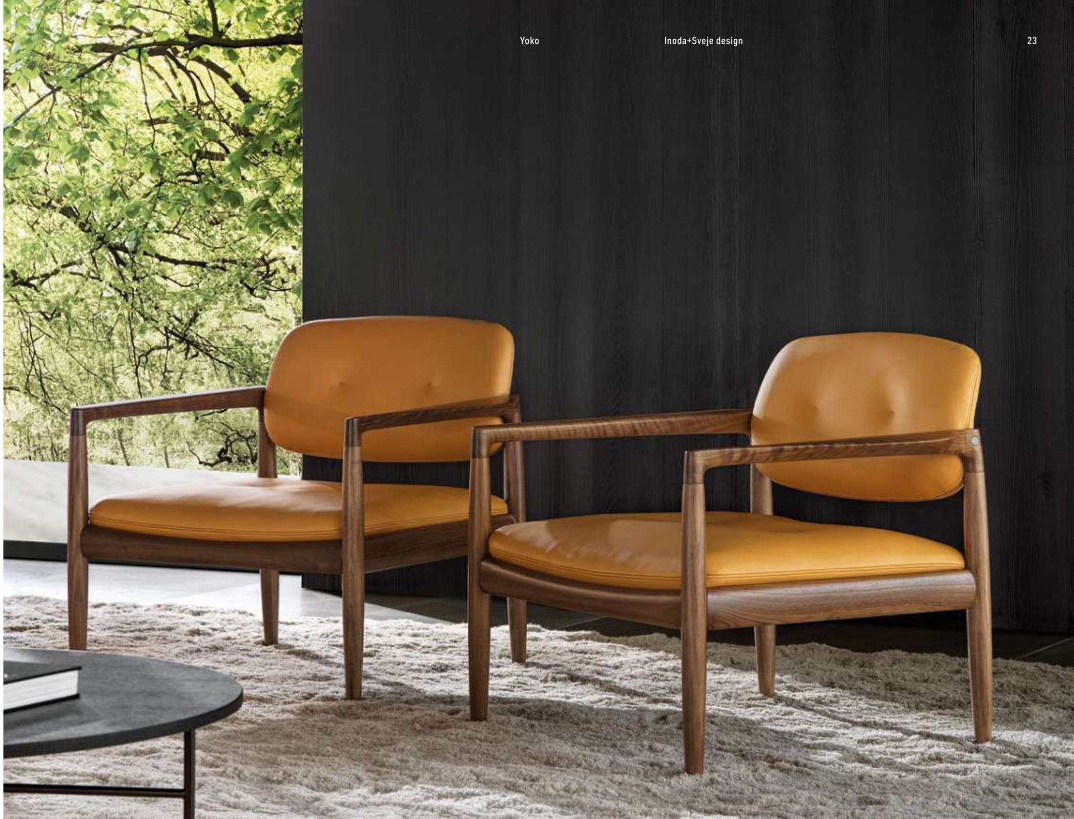
YOKO ARMCHAIRS CM 77X75 H73 LEATHER: ASPEN 41 AMBRA (ART 36/37 - ASPEN LEATHER) STRUCTURE: LIGHT BROWN STAINED CANALETTO WALNUT