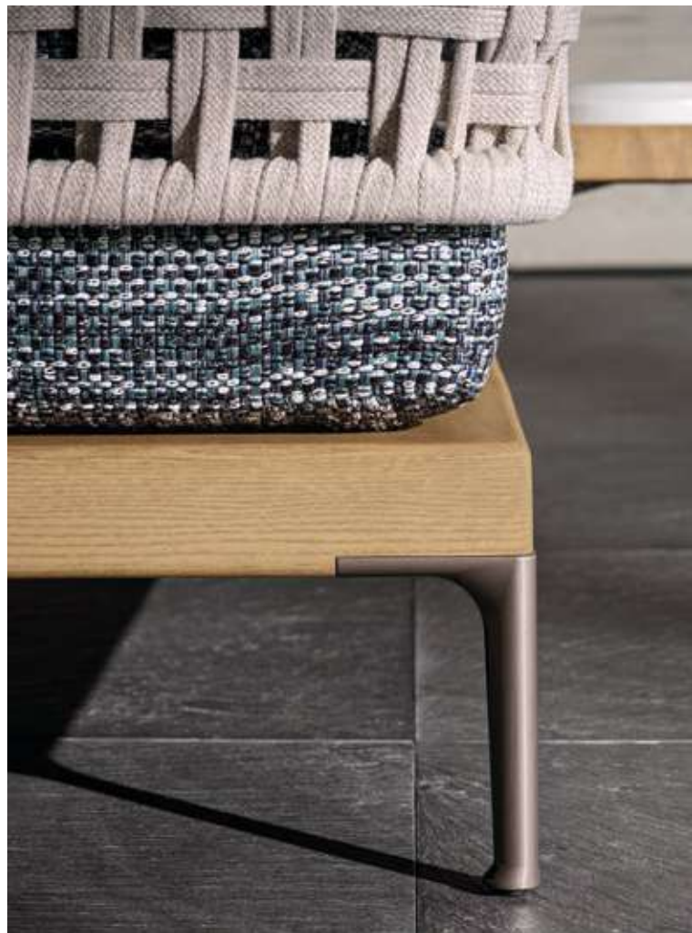
PATIO TEAK BENCH WITH COFFEE TABLE CM 180X90 H41 FABRIC: BUTTERFLY 01 SABBIA (ART LIFESCAPE 10) STRUCTURE: NATURAL TEAK FEET: VARNISHED POLISHED BRONZE COLOUR ALUMINIUM