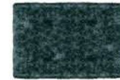
ALPS (UPDATE) MINOTTI STUDIO DESIGN 30-104