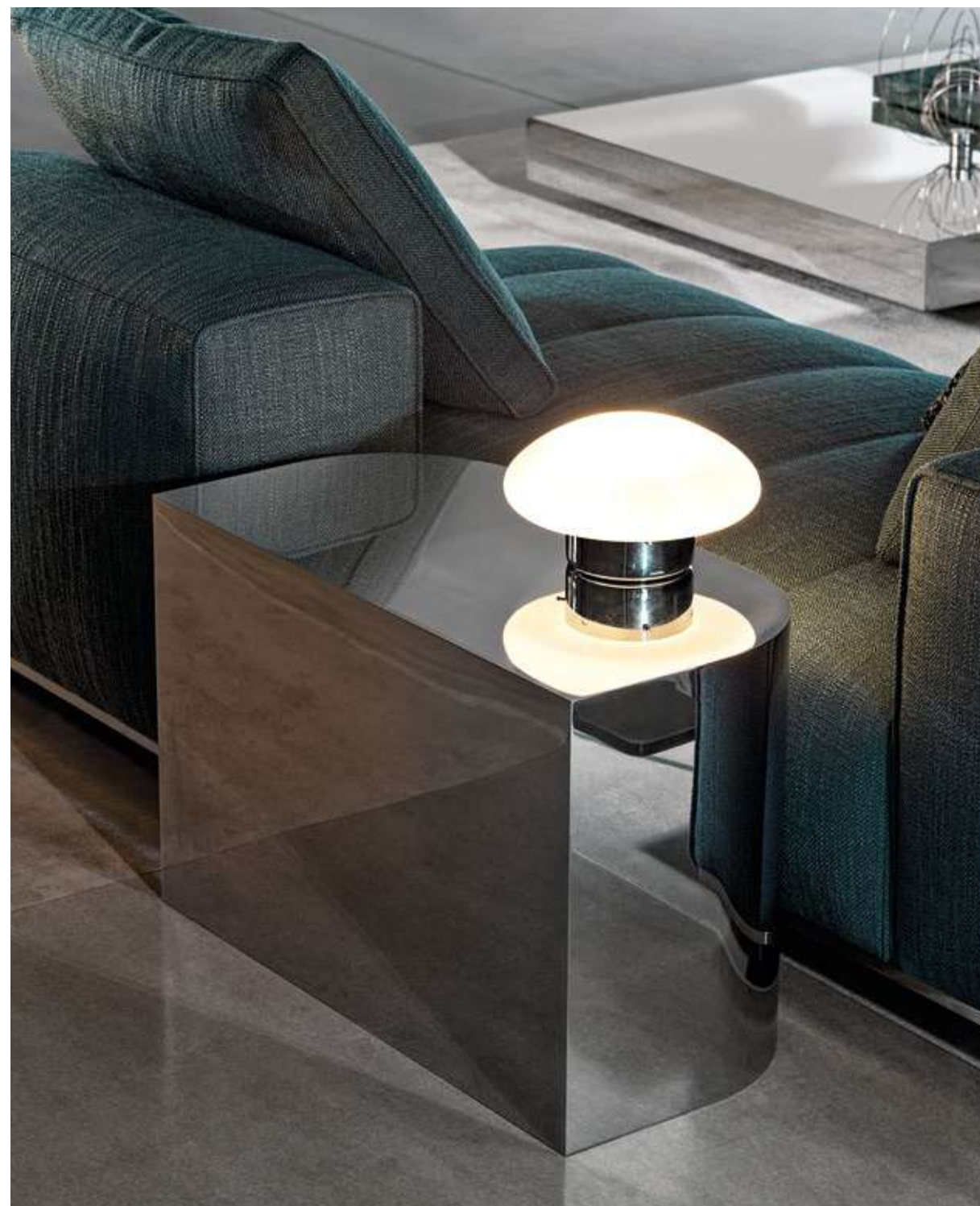
JAMES SIDE TABLE CM 70X35 H45 STRUCTURE: POLISHED STAINLESS STEEL