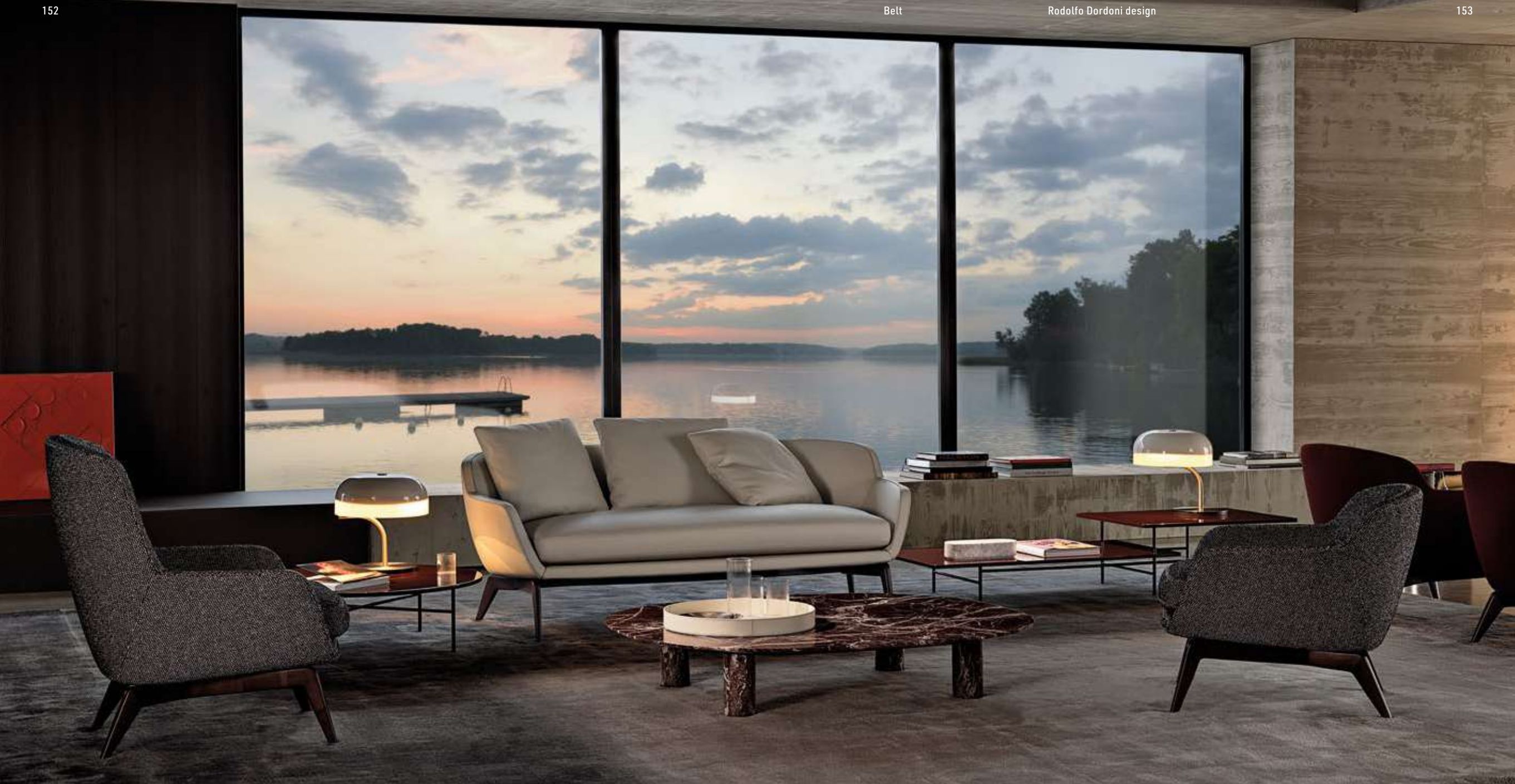
BELT SEMI-ROUND LOUNGE SOFA CM 183X94 H71 LEATHER: ASPEN 38 NUVOLA (ART 36/37 - ASPEN LEATHER) LEGS: DARK BROWN STAINED CANALETTO WALNUT