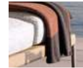
TWIST MINOTTI STUDIO DESIGN 174-191