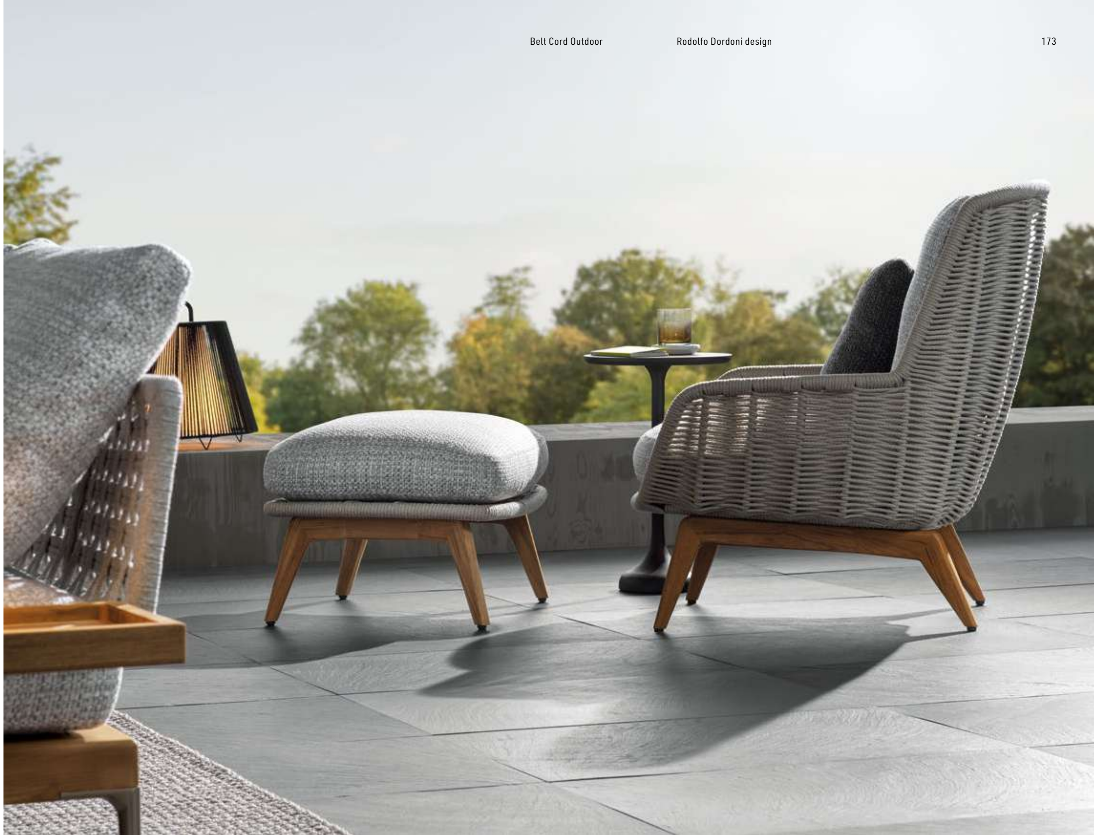
BELT CORD OUTDOOR BERGÈRE CM 78X92 H95 BELT CORD OUTDOOR FOOTSTOOL CM 64X58 H43 FABRIC: BUTTERFLY 01 SABBIA (ART LIFESCAPE 10) FIBER: SAND COLOUR BASE: NATURAL TEAK