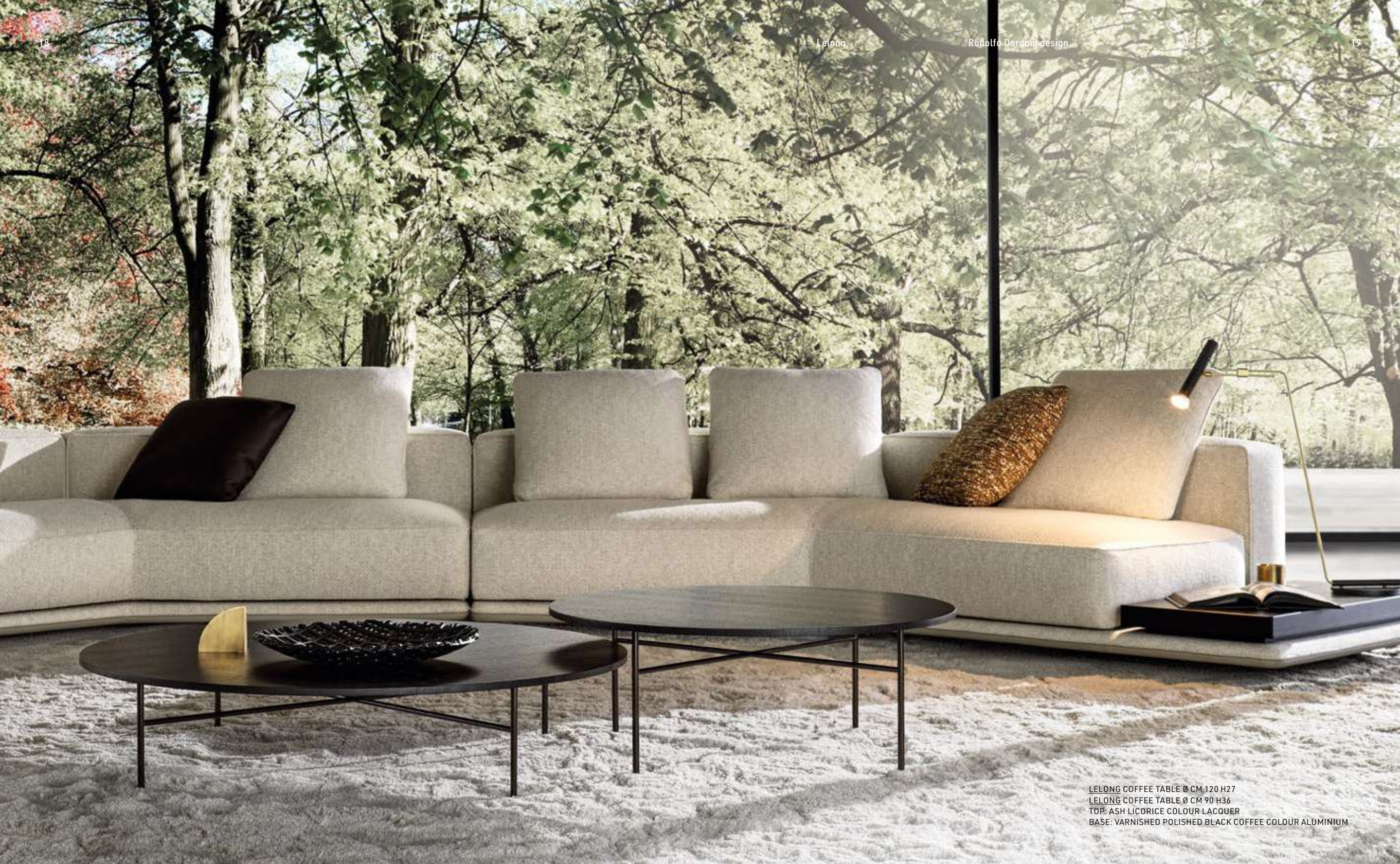
LELONG COFFEE TABLE Ø CM 120 H27 LELONG COFFEE TABLE Ø CM 90 H36 TOP: ASH LICORICE COLOUR LACQUER BASE: VARNISHED POLISHED BLACK COFFEE COLOUR ALUMINIUM