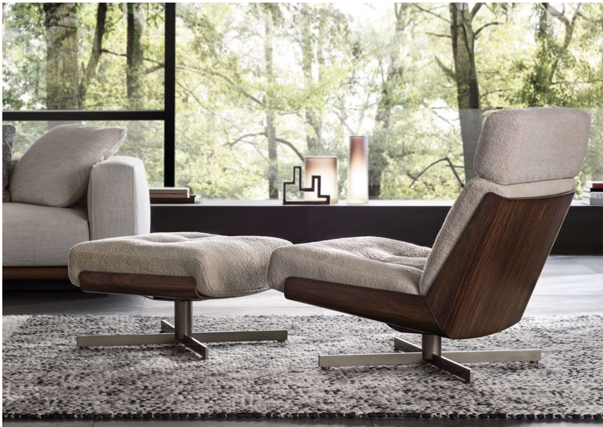
DAIKI BERGÈRE WITHOUT ARMRESTS WITH SWIVEL BASE CM 73X94 H93 DAIKI FOOTSTOOL WITH BASE CM 68X64 H40 FABRIC: TENDER 02 NUVOLA (ART TENDER) STRUCTURE: DARK BROWN STAINED PALISANDER SANTOS BASE: VARNISHED POLISHED BRONZE COLOUR METAL