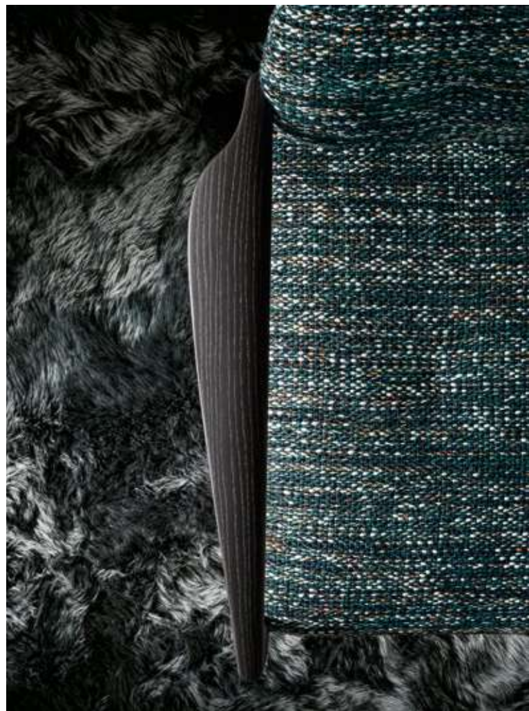
YOKO ARMCHAIR CM 77X75 H73 FABRIC: MEDLEY 05 MALACHITE (ART 37) STRUCTURE: ASH LICORICE COLOUR LACQUER