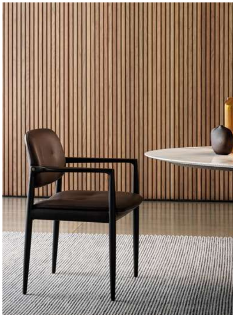
YOKO DINING LITTLE ARMCHAIR CM 62X58 H81 LEATHER: ASPEN 32 TESTA DI MORO (ART 32 - ASPEN LEATHER) STRUCTURE: ASH LICORICE COLOUR LACQUER